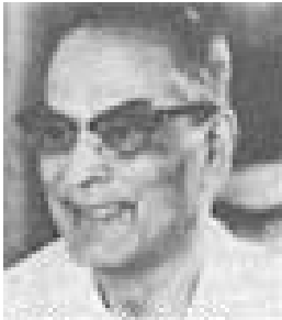
Dr. B C Roy