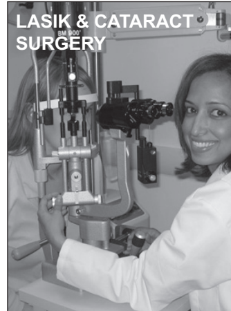
Weekly Scientific Programme & G.P. Forum pg. 04